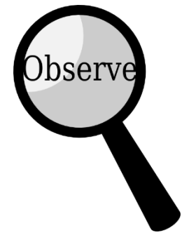
Looking at the changes in weather and plants.