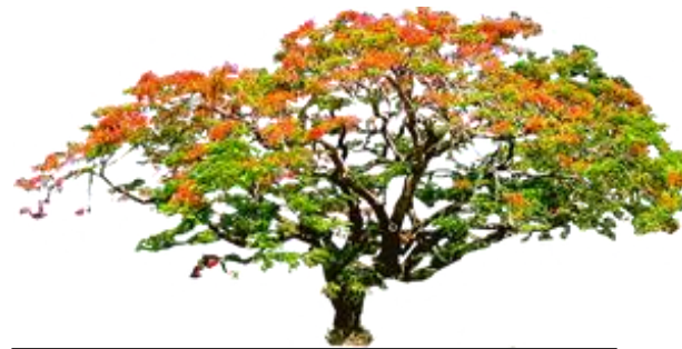
Deciduous Trees changing in autumn